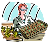
Working in a plant nursery, orchard, tree growing or harvesting