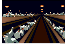
Working in a poultry farm