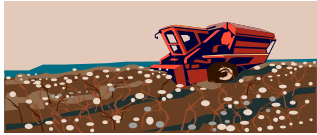
Picking cotton, vegetables, fruit, pecans, hay, soybeans, sugarcane, etc.

NO (STOP here and return survey to your child's school) YES (Please check all that apply below & continue to question 2)