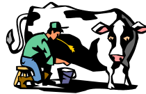
Working in a dairy farm