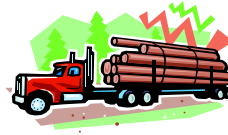
Working with timber or lumber