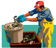
Working in a commercial fishing, fishery, or crawfish ponds