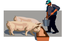
Working with livestock such as cattle, goats, sheep, horses, rabbits, hogs, or turtle farming.